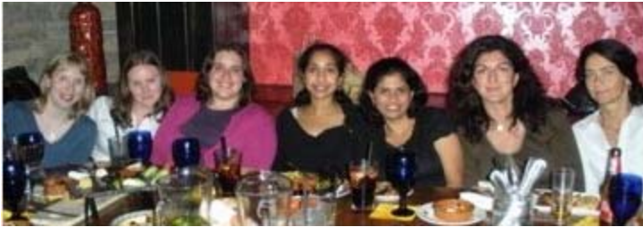
GE Engineers at the SWE National Conference, Long Beach, CA